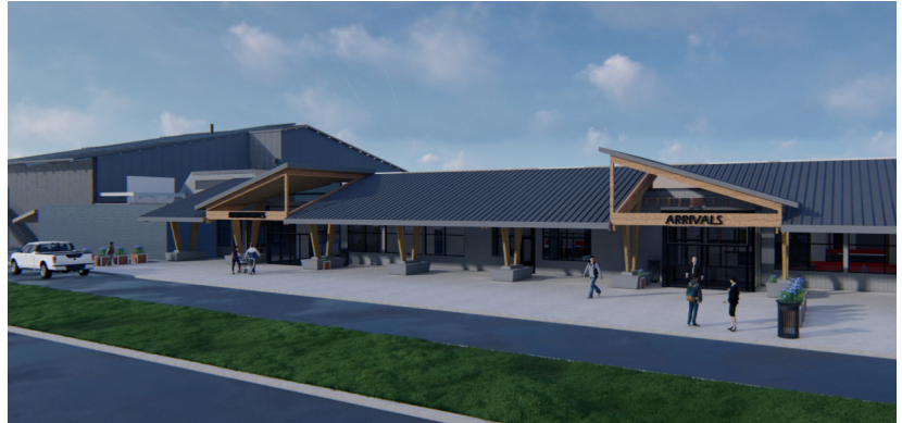
Project Rendering - Remodel Phase 2

The Remodel and Curb-Side Improvements Phase involves interior remodel of the existing terminal to improve passenger flow, TSA baggage screening and expand the baggage claim belt and area. This phase also includes small additions on the curb side of the terminal with new entrances/exits for arrivals and departures and a new curb-side canopy along the length of the building. New interior finishes and building systems will tie the remodeled building into the additions.