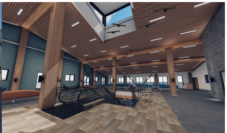
Project Renderings - Expansion Phase 1